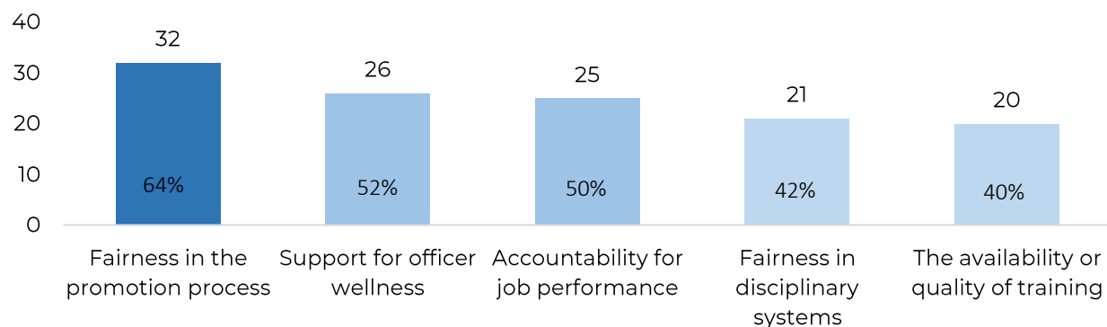
TABLE #15 – WHICH OF THE FOLLOWING ASPECTS OF CPD MANAGEMENT DO YOU THINK ARE MOST IN NEED OF IMPROVEMENT?

Among these areas, CPD members frequently identified “Fairness in disciplinary systems” and “Support for officer wellness,” which correspond to priority areas identified by community members. However, OIG is working to gather more responses from current CPD members to ensure the survey represents a broad spectrum of perspectives and looks forward to CPD’s cooperation in gathering those responses.