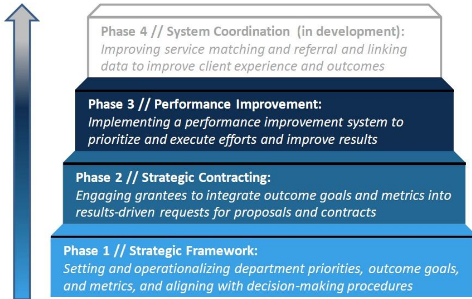
Figure 1: The Commitment to Outcomes Has Four Phases Built Upon a Strategic Framework